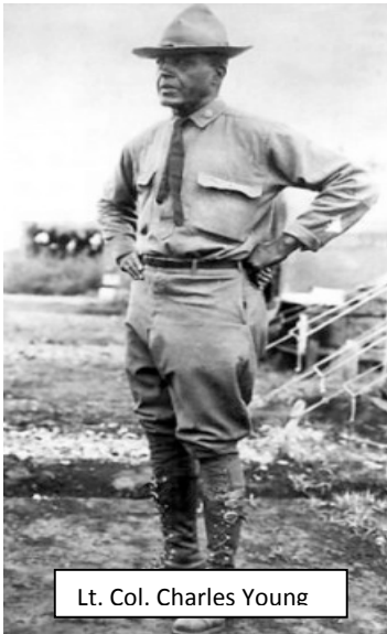
Lt. Col. Charles Young

What was their role in the National Parks?